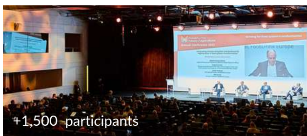
ANNUAL CONFERENCE IN BRUSSELS