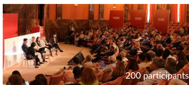
REGIONAL EVENT IN SPAIN