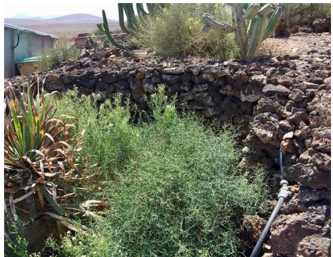
Construction of more than 150 m of dry stone walls