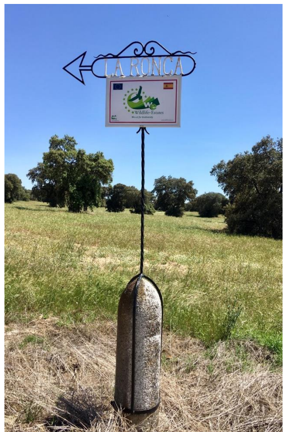
Signalling through official Wildlife Estates plates.