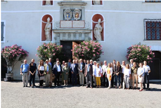
Participants of Wild Life Estates Steering Committee

In September the Wild Life Estates Steering Committee took place in the Esterházy property in (Austria) where members from eleven countries met to update and present new proposals for the Wildlife Estates project.